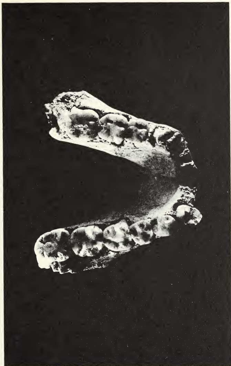
Fig. 2. Type specimen of the new species Australopithecus afarensis , the mandible L.H.-4 from Laetolil, Tanzania. Occlusal view. Natural size.